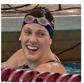
200m Backstroke World record holder, Missy Franklin.

Missy swims about 60,000 yards a week and trains every morning from 5:00 - 7:00 a.m. and every evening from 6:00 -8:00 p.m. (She burns approximately 8000 calories a day.) Missy has the ideal build for a swimmer. She is 6'1'_{2} " tall, but has a wing span of 76". For the "normal person," wing span is usually equal to height. This,