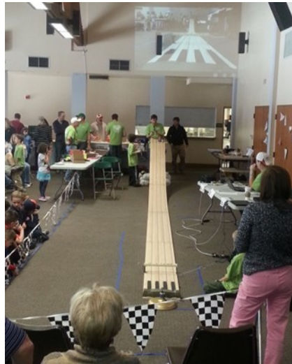
Cub Scout Packs 205 & 711 hold Pinewood Derby

with the Bethany Lutheran Pack 711 for their Pinewood Derby event. The boys had the usual grand time racing. Pack 711 track is something to behold. Event placing's are based on the times when light beams are tripped at the finish line. The entire race is pictured. and projected on the wall above the starters. The camera is looking from the finishing end with "piano key" looking black