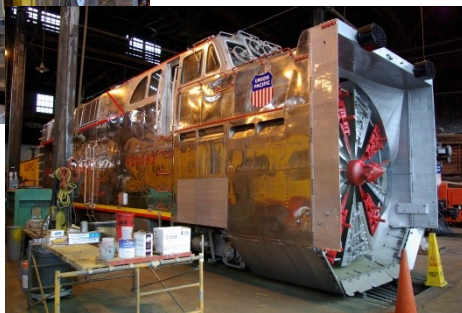
Union Pacific Rotary Snow Plow