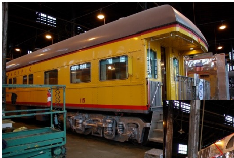
Union Pacific 115 Business Car Photos from Greg Hurd's presentation