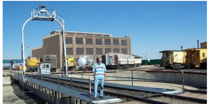
Cheyenne Turntable and Steam Maintenance Shop in background