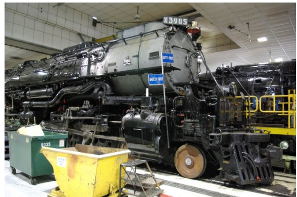
3985 Steam Engine in shop for maintenance