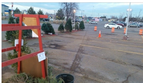
What the tree lot looked like on late Saturday evening, December 20th.