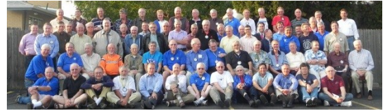
100% DAY 2012

2012 100% Day Photo Available: Marc Goodbody has reminded us that the 2012 photos is still available. See Marc for details.